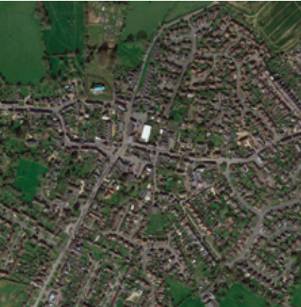
Aerial view of Long Buckby

“At the Triple 1 Group we practice fair treatment and opportunity so that all our employees feel supported...”